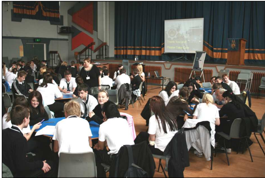
Senior students discuss road safety issues.

The pupils also were involved in designing a new campaign for the Grampian Fire Service. The Fire Service was delighted with the ideas raised and is still considering various ideas from the pupils. Pupil evaluation was very positive and many have learned an important lesson on road safety.