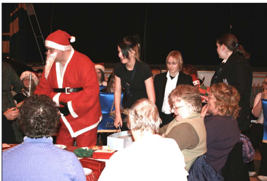
Santa's visit to St Machar Academy to greet the senior citizens.

On 12 December we welcomed approximately 120 pensioners to St Machar Academy for a Christmas party. The event was organised jointly by the Enterprise group and the SFL department over a period of time. A lot of effort goes in to events like these but it is so heartening at a time when some young people get a bad press to see how well our pupils look after our Senior Citizens. The party is always much enjoyed by everyone.