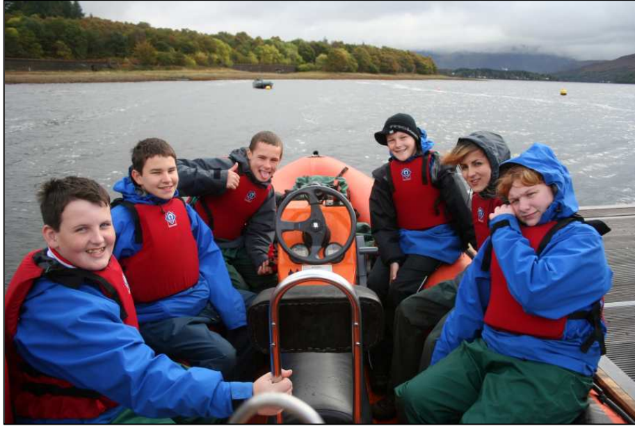
S3 pupils take to the water at Loch Eil

The Outward Bound courses are part of our work towards meeting the aims of our School of Ambition programme and we believe that by participating in the Adventure and Challenge course pupils can experience a very different and challenging learning environment and their confidence and self-esteem will improve along with their ability to work as part of a team. The following are the thoughts of two of the pupils who took part: