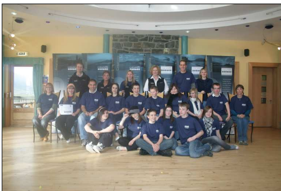
Staff and pupils in Skye

This week long course focused on the Columban Code of Responsible Leadership - awareness, focus, creativity, integrity, perseverance and service. It was a busy week with long days and extremely challenging activities – both mental and physical – but it had a huge impact on everyone who took part and the following quote from one of the pupils sums up the Columban effect.